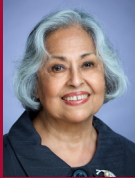
Gloria Negrete-McLeod Vice President