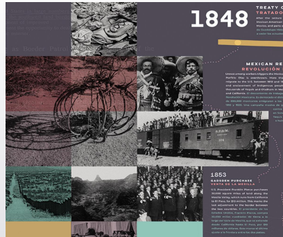
Image from Hostile Terrain 94 installation at Museum of Us, San Diego, CA . detail of immigration timeline at US/Mexico border.

Goal= raise awareness about migration issues on a global scale