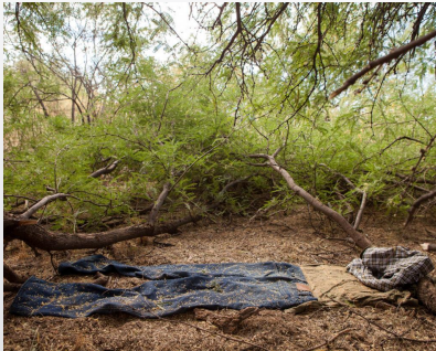
Image from Hostile Terrain 94 installation at Museum of Us, San Diego, CA.

Spring/Summer 2025- Planning, outreach/in-reach, public programming design, exhibition design;