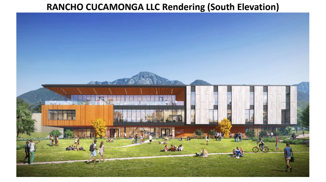
RANCHO CUCAMONGA MACC Renovation & Addition