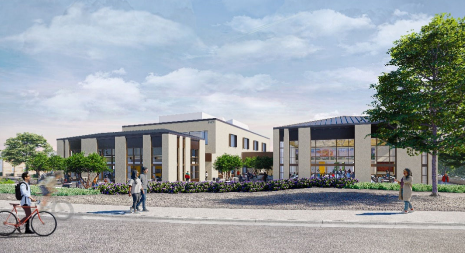
RANCHO CUCAMONGA MACC Renovation & Addition